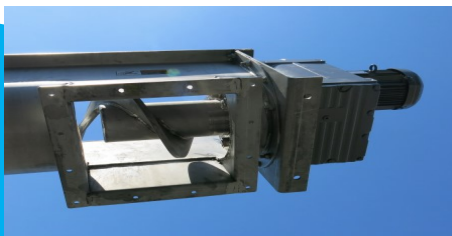
AugerConveyor Model AC-12

PEWE is an innovative company leading in the field of industrial water and wastewater treatment systems. PEWE offers products worldwide to the food, petrochemical, pharma, metal, electronic, and other industries including the municipal market.