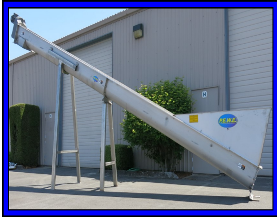
PEWE AugerConveyor Unit Model AC-12 Complete with solids hopper, flanged discharge and support stand.