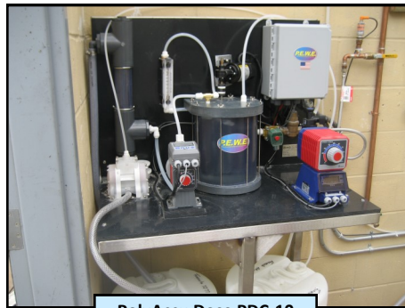
PolyAccu Dose PDC-10

It was determined that with careful use of valuable space, a complete "green" wastewater treatment plant upgrade was possible. The new system entailed a PEWE externally fed rotary PEWE SuperSkreen , EQ balance tank, flow proportional feed, a PEWE PolyAccu Dose chemical make-down unit, a stainless steel PEWE HD² XLRator DAF unit