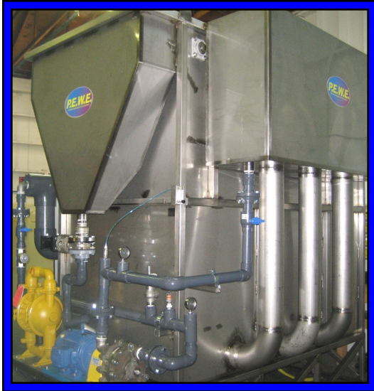
PEWE HD 2 XLRator® LS-175 Dissolved Air Flotation unit.