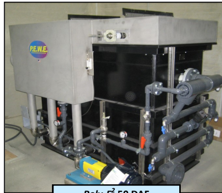
Poly-E 2 50 DAF

Process water is collected continuously in the EQ tank and then enters the LCM aerobic biological unit for removal of largely dissolved impurities. The DAF provides final clarification. Bio-solids are pumped to a holding tank for later wet hauling. The entire system can move water via gravity once it is initially pumped to the