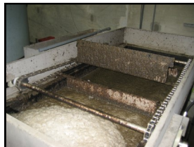
Bio-solids are rich in nutrients

EQ tank. This helps reduce the carbon footprint by limiting energy consumption. The whole system is located in a special room behind the maintenance shop for easy periodic cleaning and access.