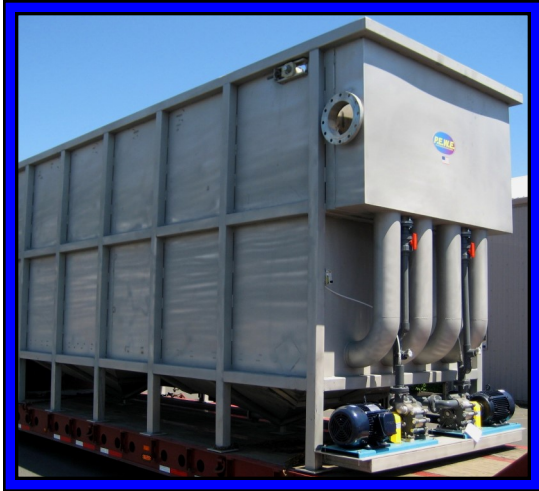
PEWE Nx 2 JEM ® AS-800 Dissolved Air Flotation unit.