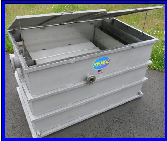
PEWE OWS Oil/Water Separator Model OWS-200 Complete with hinged lid, 150lb flanged fittings and lifting lugs/pockets.