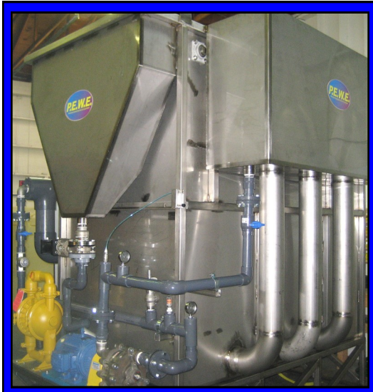
PEWE Clarification System