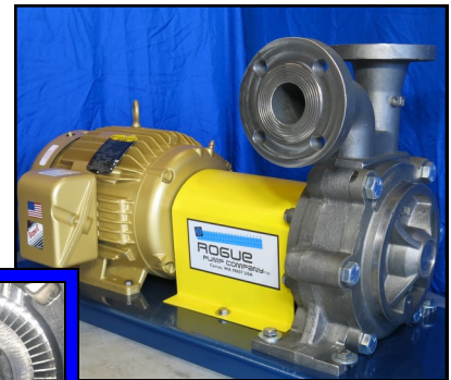
PEWE uses Rogue MAX RGT™ regenerative turbine pumps.