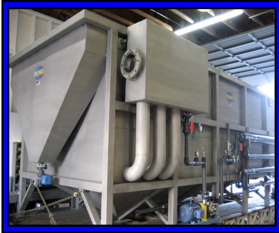
PEWE T 2 -MAX™ Thickener DAF unit.