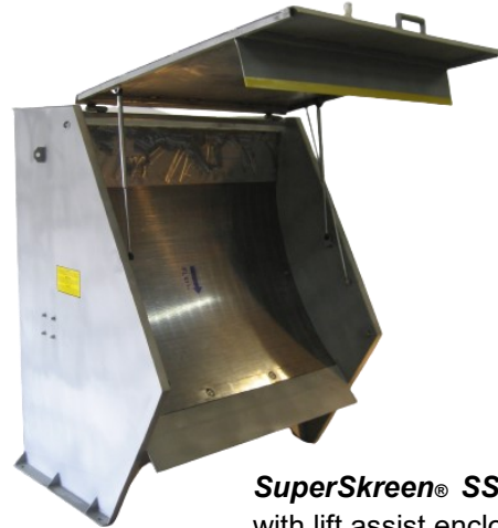
SuperScreen® SSP-48 with lift assist enclosure

The screen operates by feeding the solids laden influent water to the headbox. The water then flows over a distribution weir onto the steeply angled screen surface. Solids ride the screen to it's base and fall off at the discharge lip into a waiting receptacle for disposal. The water passes directly through the screen to a collection pan.