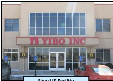
New US Facility

The new YIBO, Inc. facility in Warrenton MO is the firm's first US production plant. Using state of the art equipment they will manufacture 26 varieties of soy sauce products for the commercial market. Five gallon containers will be distributed nationwide. As a discharge requirement the local POTW requested a wastewater plant for effluent control prior to release. Without an operating facility an estimated flow along with surrogate numbers for TSS and BOD were utilized in designing the treatment system.